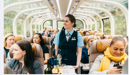
Complimentary Wine & Cheese

All aboard the Rocky Mountaineer Train for the experience of a lifetime on the 'most spectacular train trip in the world!' Experience Rocky Mountaineer's Gold Leaf Service featuring the Bi-level Glass Dome Coach for panoramic viewing, gourmet breakfasts and lunches created by Executive Chefs, morning scones and afternoon wine & cheese, and exclusive outdoor viewing platform revealing a non-stop parade of glorious living postcards!