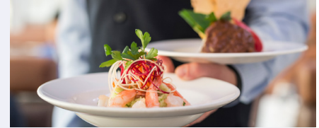
Gourmet Food crafted by Signature Chefs